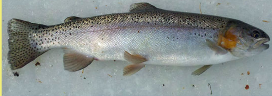
17.5" Rainbow Trout